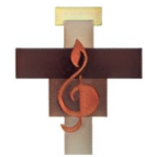
St. Anthony Camerata Chorale Festival Choir

Whether you listen all day from home or work ...or for short periods during your commute, a Catholic radio station is worth having available in our local communities. Please welcome our Catholic Spirit Radio guests and prayerfully consider how you can financially support this project! catholicspiritradio.com (309) 807-2427 108 Boeykens Place, Normal IL 61761